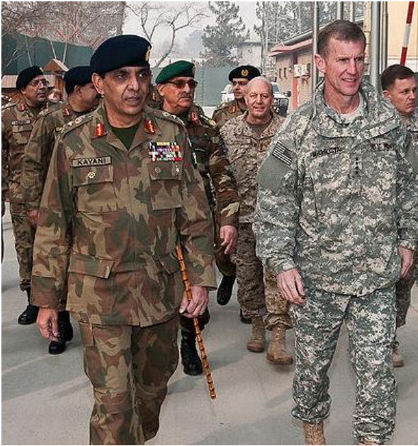
Former Chief of Army Staff of the Pakistan Army, Gen. Ashfaq Parvez Kayani, meets with former Commander of NATO International Security Assistance Force and US, Gen. Stanley A. McChrystal

strikes and SOF raids can be ordered, monitored and reviewed within the Oval Office, once partner capacity has been built in foreign security forces, the US cannot compel its recipients to employ it in a particular manner. Thus, there is no guarantee that this capacity will be used a way that is amicable to US interests. 37 In this respect, there are significant trade-offs in the use of SC and the indirect approach more broadly.