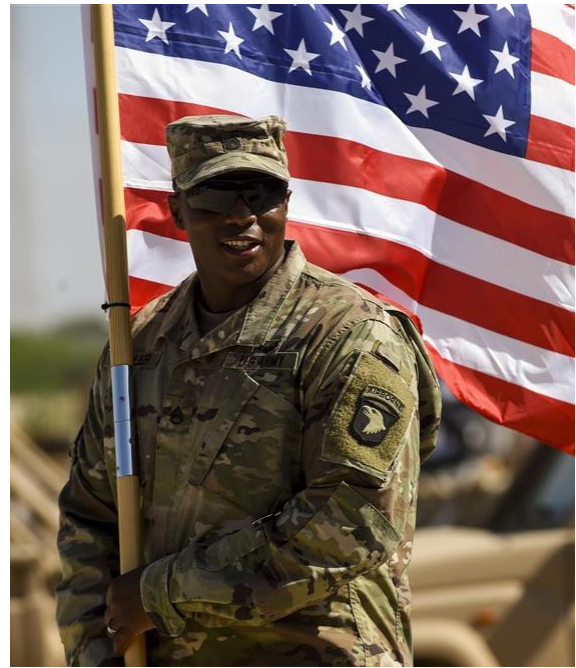
U.S. Army Staff Sgt. holds the American flag during a graduation ceremony for Somali National Army soldiers

Efforts to train and equip the Somali National Army were hindered by political instability, and Somalia was only made eligible for US 'defense articles and defense services' in April 2013. Whilst US SOF would train their Somali counterparts, reportedly also accompanying the Dannab (Alpha) brigade on raids against Al-Shabaab, 75 Somalia received less SC aid than AMISOM-contributing states. The Obama administration worked to build counterterrorism, counterinsurgency and peacekeeping capacity in AMISOM-contributing states through a patchwork of security cooperation programmes. These included Section 1206, the Section 1207(n) Transitional Authority, the CTFP and the Peacekeeping Operations Fund.